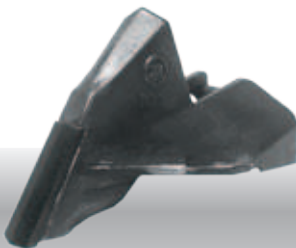
610-TIP-4030 PAIRED ROW TIP