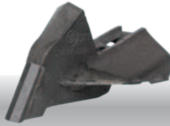
610-TIP-4081 PAIRED ROW TIP

Fertilizer Options: Used for seeding only.